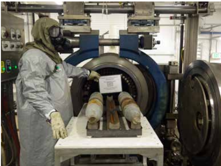
The first PCAPP EDS campaign, from March 2015 to February 2016, resulted in the safe destruction of 549 munitions and 11 DOT bottles.

The condition of some munitions at PCD posed a problem for the PCAPP automated process, making it necessary to select an additional destruction method to augment PCAPP. In April 2013, PEO ACWA announced selection of the Explosive Destruction System (EDS), designed and owned by RCMD, to destroy approximately 1,800 problematic items.