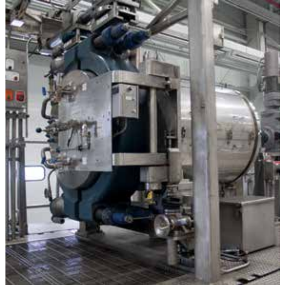
In 2013, PEO ACWA announced selection of the EDS, designed and owned by RCMD, to destroy problematic munitions prior to the start of PCAPP operations.

The Program Executive Office, Assembled Chemical Weapons Alternatives (PEO ACWA) is the Department of Defense program responsible for the destruction of chemical weapons in Colorado. Working in partnership with the community, the Army selected neutralization followed by biotreatment to destroy the PCD chemical weapons stockpile. In 2012, construction was completed on the Pueblo Chemical Agent-Destruction Pilot Plant (PCAPP), which uses an automated process to destroy the munitions stored at PCD.