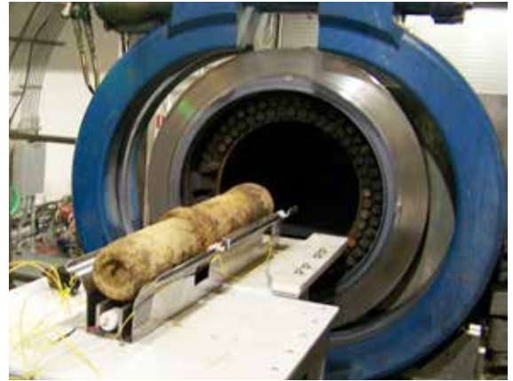
The EDS provides on-site treatment of recovered chemical warfare materiel in a safe, environmentally sound manner.

The EDS uses cutting charges to access chemical munitions, eliminating their explosive capacity before neutralizing the chemical agent. The system's main component, a sealed, stainless-steel vessel, contains all the blast, vapor and fragments from the process, keeping the workforce, community and environment safe.