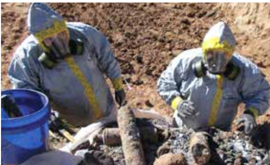
The U.S. Army periodically recovers buried chemical warfare materiel at military installations where chemical manufacture, storage and testing took place.

The completion of the mission in April 2010 was a milestone, marking the elimination of all non-stockpile materiel declared upon the United States' entry into force of the Chemical Weapons Convention, an international treaty mandating the destruction of CWM.