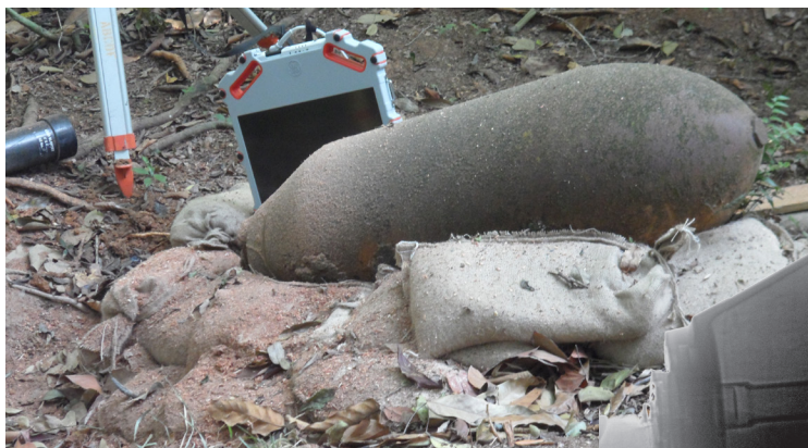
The high-energy X-ray generator allows for increased image resolution for thick-walled and overpacked munitions.