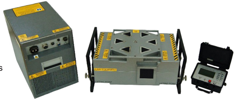
The high-energy X-ray generator consists of a power supply, an accelerator and a control panel.

RCMD's future development efforts, which will be conducted at Idaho National Laboratory, include adapting the LIXS and DRCT for X-ray assessment of items of interest that may require higher-energy systems.