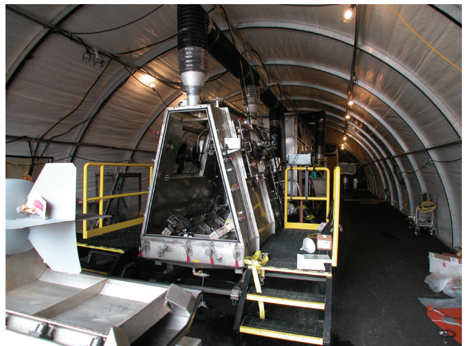
Located within an environmental enclosure, LITANS treats large RCWM items, such as 500-pound and 1,000-pound bombs and ton containers filled with chemical agent.