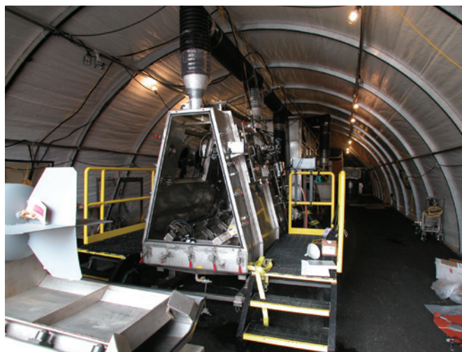
Located within an environmental enclosure, LITANS treats large RCWM items, such as 500-pound and 1,000-pound bombs and ton containers filled with chemical agent.